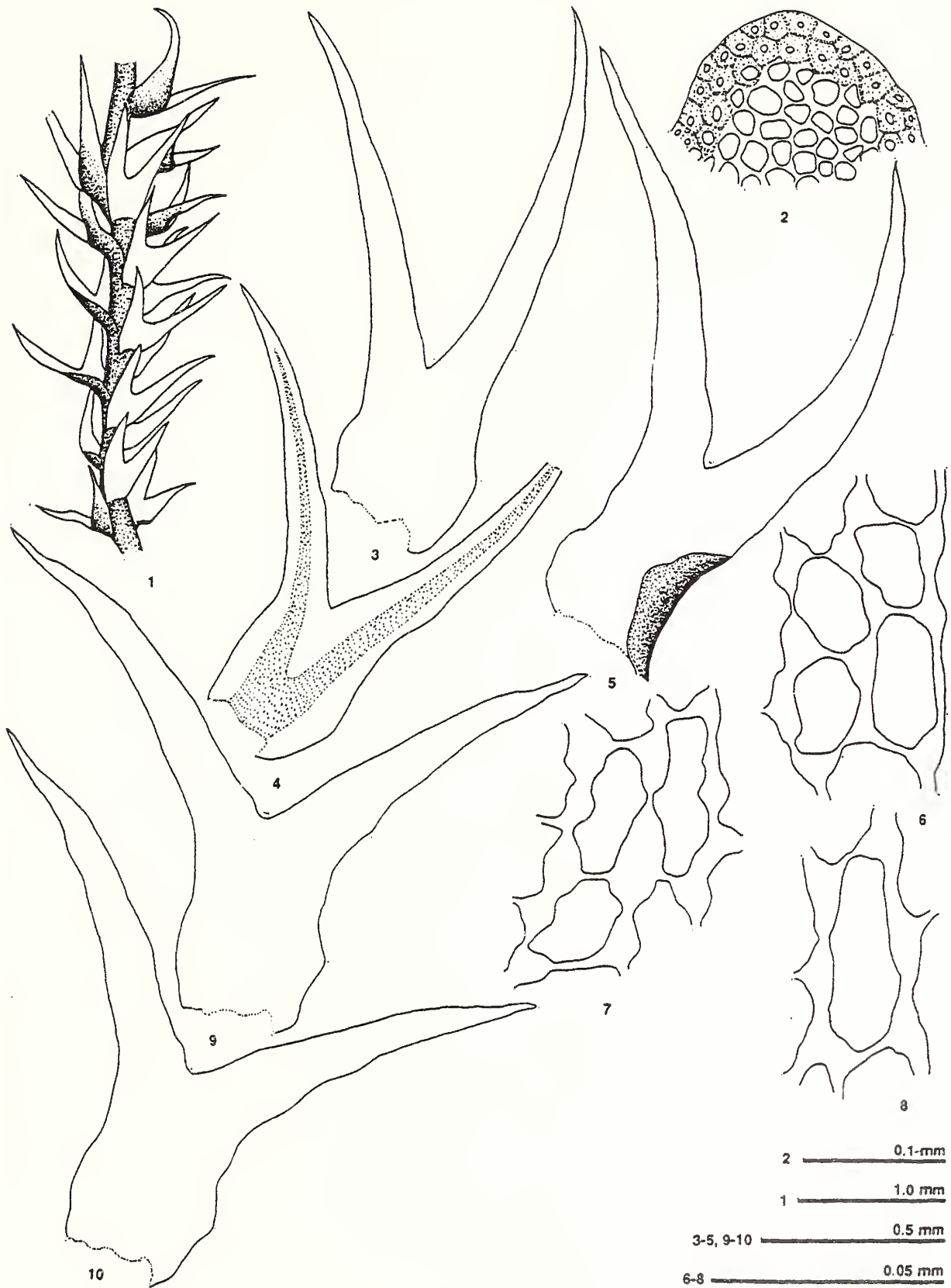
Fig. 4: Herbertus mastigophoroides Miller. 1-10. (LWG 201214-D): 1. Plant ventral view; 2. Cross-section of stem; 3-5. Leaves; 6. Leaf marginal cells; 7. Leaf median cells; 8. Leaf basal cells; 9-10. Underleaves